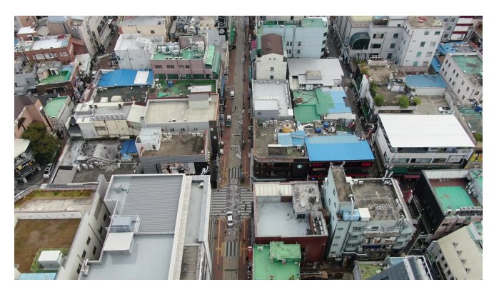
Fig. 3. Original drone image before cropping image.

The network in this paper is easy to understand as shown in Fig.1. The configured network is structured very sequentially. Simply, CB and SB are connected in sequentially.