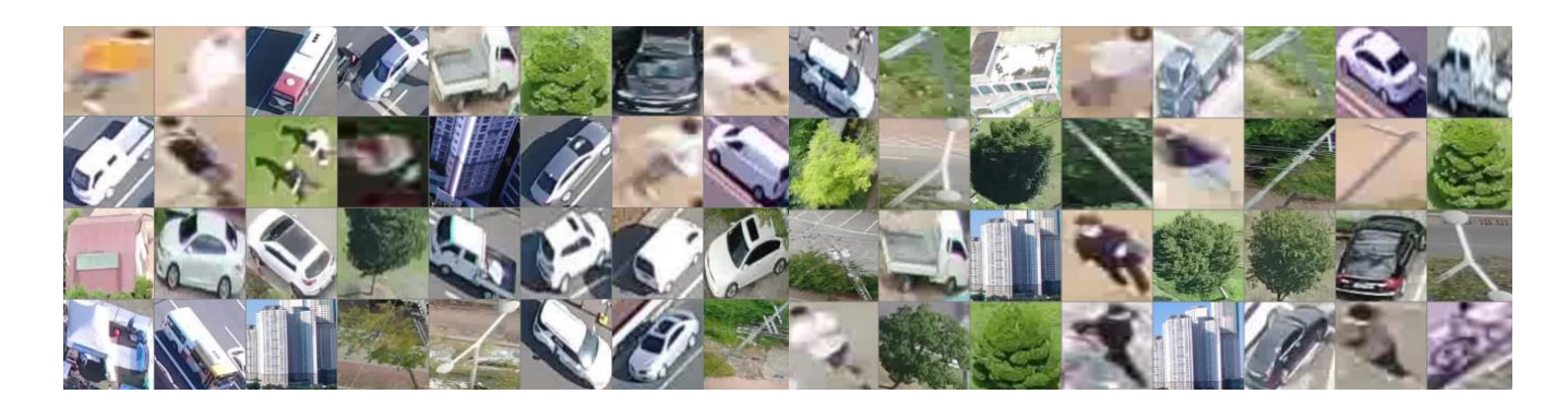
Fig. 4. Example Image of Drone Image Dataset.