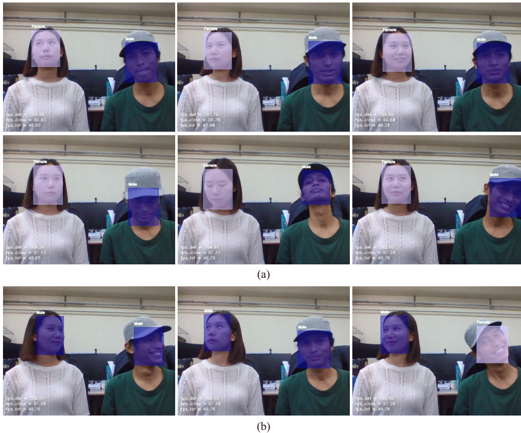
Fig. 3. The precise detection result (a) and the imprecise detection results (b) of the FG-CPU detector.

gender detector on a CPU compared to other common and lightweight CNN models. Even though Squeezenet has become the fastest facial gender detector on the CPU, the accuracy is lower than MudaNet, with a difference of 3.42. The recognition results of the FG-CPU detector can be seen in Fig. 3 (a). The white bounding box refers to a female face, and the blue bounding box refers to a male face.