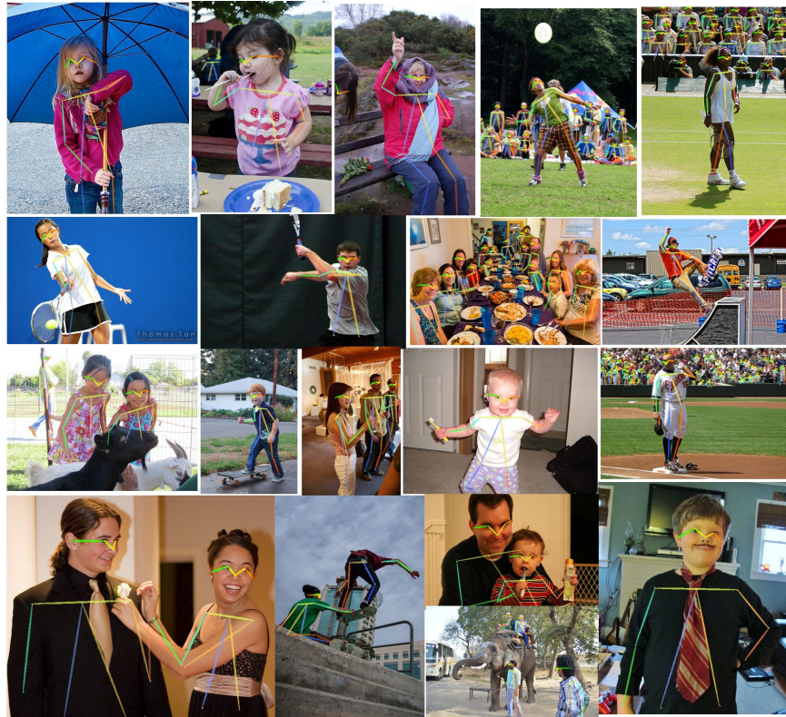
Fig. 3. Qualitative result for human pose estimation in COCO2017 test-dev set