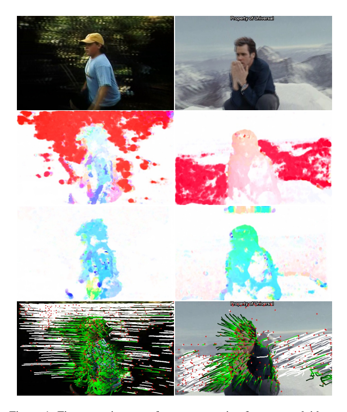
Figure 1. First row: images of two consecutive frames overlaid; second row: optical flow [8] between the two frames; third row: optical flow after removing camera motion; last row: trajectories removed due to camera motion in white.

Many classical image features have been generalized to videos, e.g. , 3D-SIFT [33], extended SURF [41], HOG3D [16], and local trinary patterns [43]. Among the local space-time features, dense trajectories [40] have been shown to perform best on a variety of datasets. The main